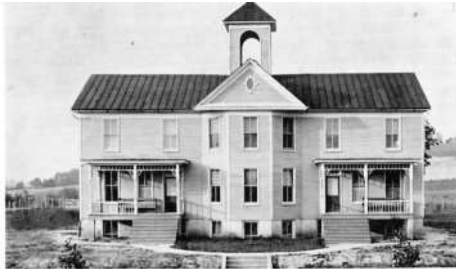
The original main building contained living quarters for students and faculty, dining room, classrooms, chapel, and the spirit that continues to make SVA unique.